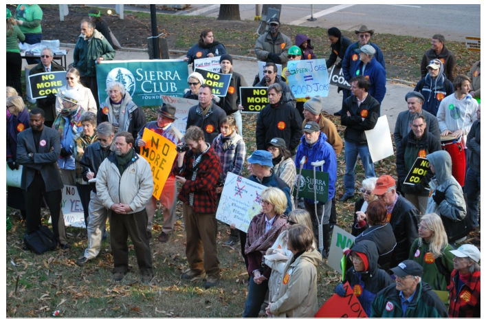
No New Coal Rally in Baltimore attracted over one hundred citizens—on a weekday! The transmission line project is still on hold!

But we need to raise the other half, and now! That's why your donation counts double right now.