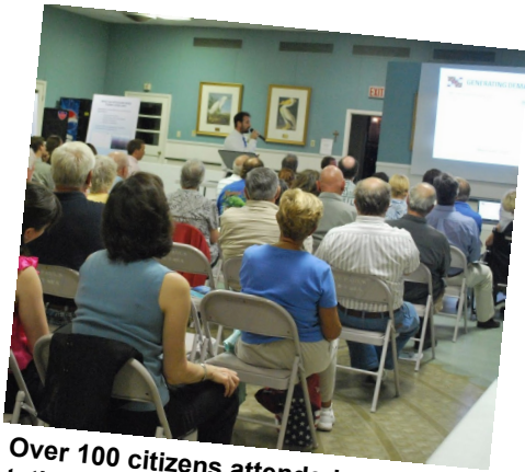
Over 100 citizens attended a presentation on off-shore wind power in Ocean City.

Maryland Sierra Club volunteers are the front ranks of the campaign to build political consensus for clean energy. Sierra Club Maryland volunteer Carolyn Mullen has worked on a bluegreen alliance reaching out to steelworkers to make sure new jobs come to Maryland through renewable energy sources. Governor O'Malley recently responded: "By harnessing the outstanding wind resources off of Maryland's coast, we can create thousands of green collar jobs, reduce harmful air pollution, and bring much needed, additional clean energy to Maryland."