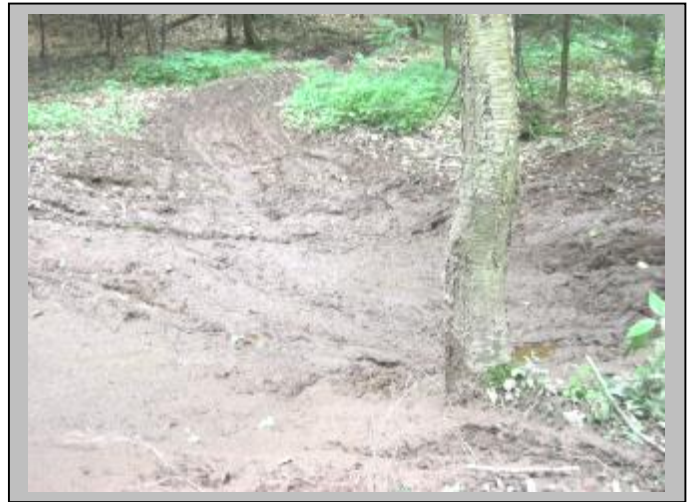
Large Mud Pit Caused By ORV / ATV Abuse In Savage Ravines Wildland

you a hunter or fisherman? Plenty of opportunities abound for sharing what you see in the field. Is the turkey population healthy? See many bears? Seeing signs of deer overgrazing in particular areas?