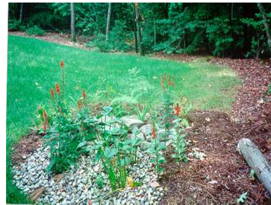
A Finished Garden.